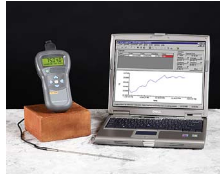
LogWare software can be used to graphically and statistically analyze data logged to the Model 1522 LLL. LogWare can also turn either Handheld Thermometer into a real-time datalogger.

Then ask them to give it all to you in one package. Hart Scientific does—at a price you'll love. Call us today and get the most powerful handheld thermometers in the world.