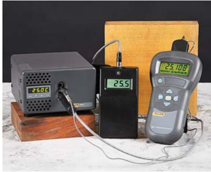
Handheld Thermometers make excellent reference standards for field calibrations.

A wide variety of standards-quality probes are available from Hart in many different shapes, sizes, and price ranges. Please refer to our selection of probes on page 60. The uncertainty of your probe should be added to the uncertainty of the meter to compute total system uncertainty.